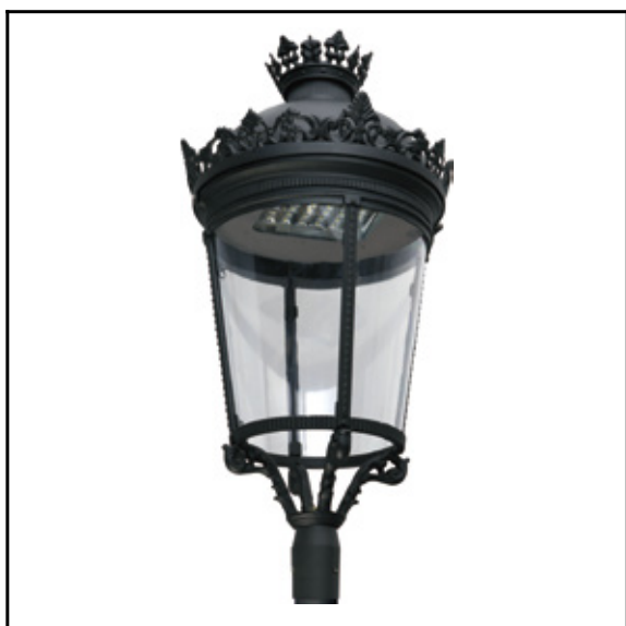
The photograph may not match the reference exactly. Please read the product description to identify the finish.