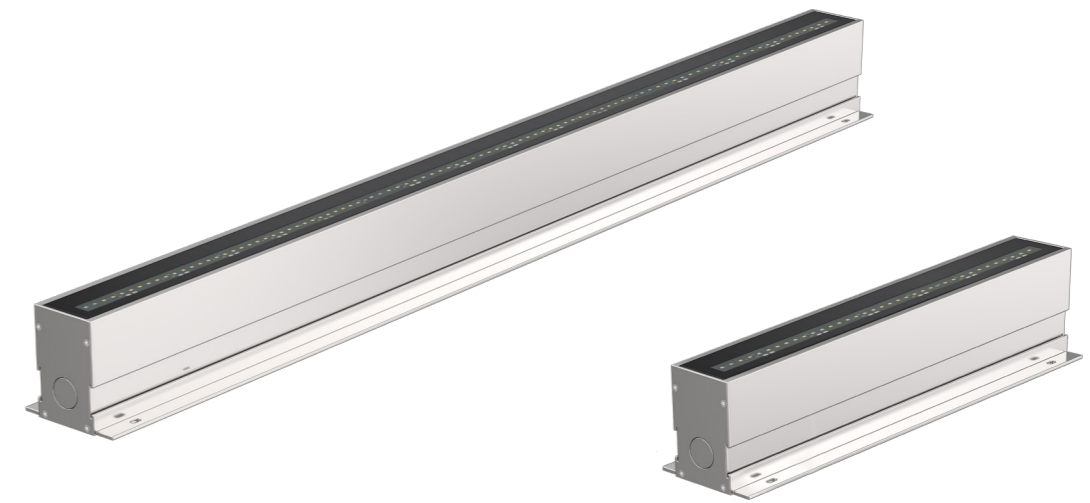
M-211 7W / 14W / 21W