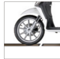
Resistance to static load (2000 Kg)